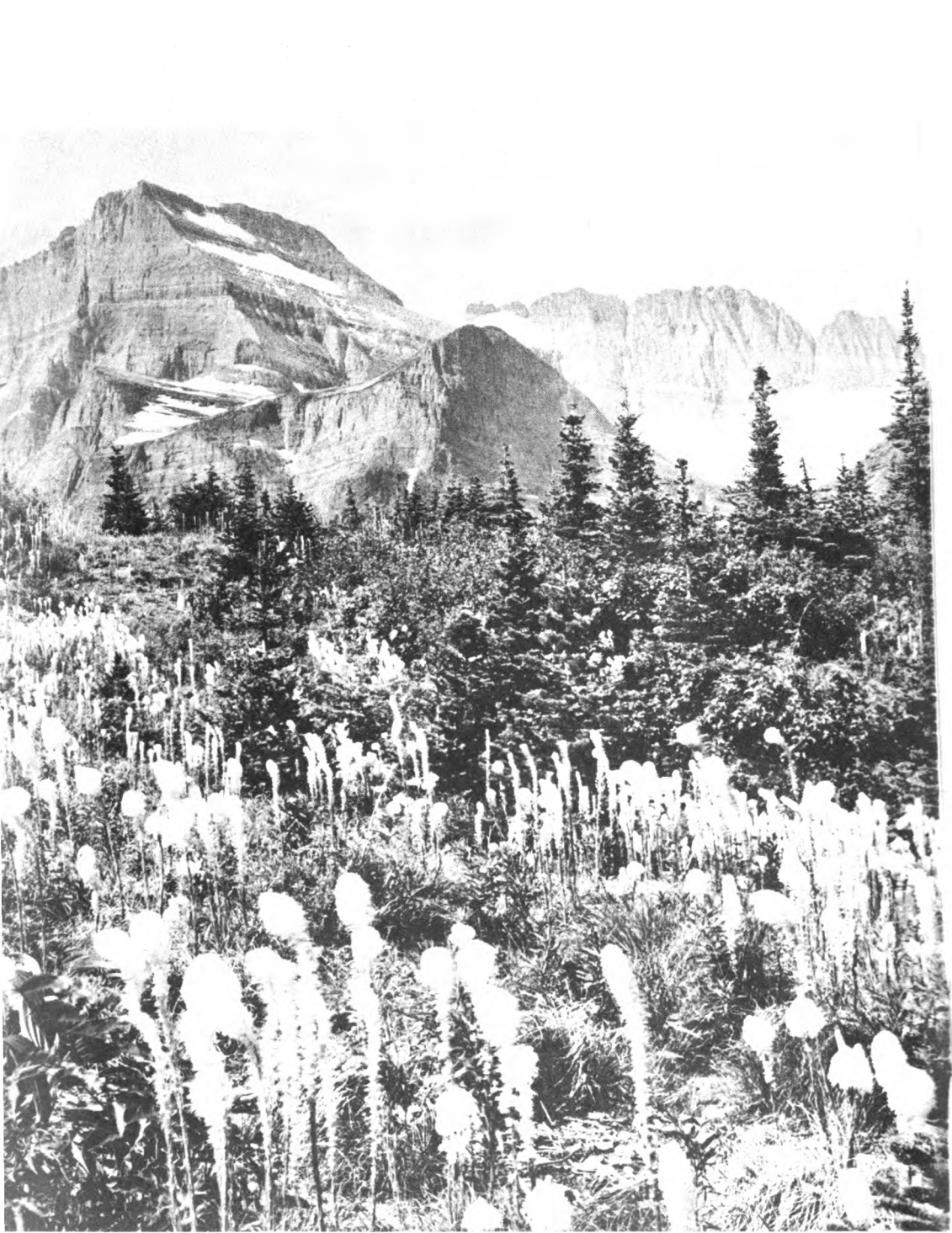
BEAR GRASS GROWS IN ABUNDANCE